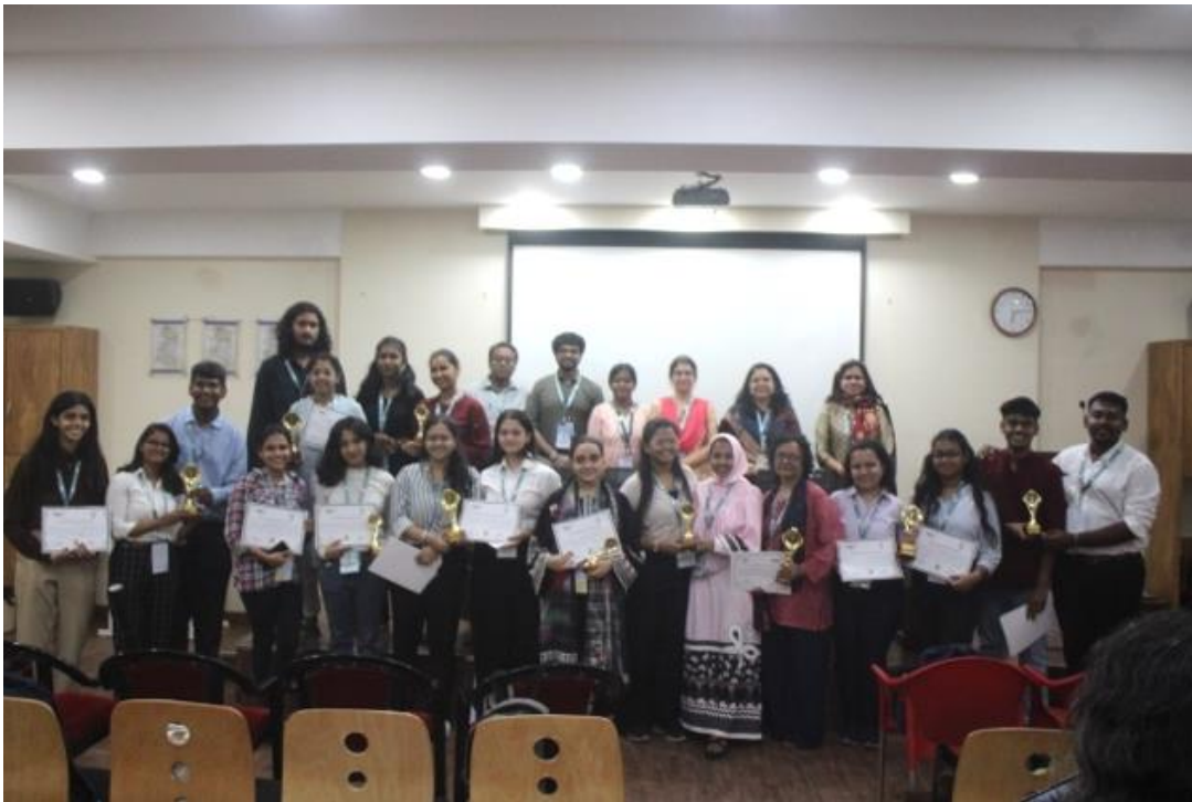
Prize Winners Jignyasa (2024-25)