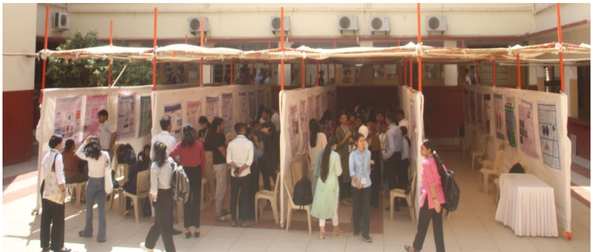
Poster Presentation- Jigyasa (2024-25)