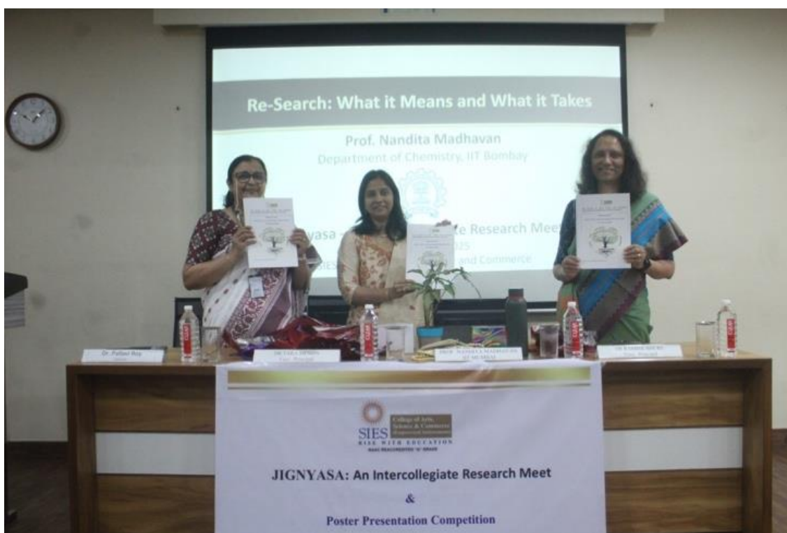
Unveiling of Abstract book